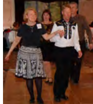
L: Round dancers