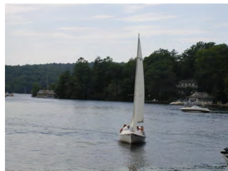
See article on the Reelers' 50th Anniversary on opposite page. →