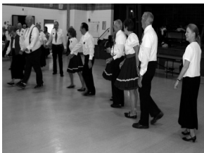
Reelers raiding a Kittatinny Rangers dance